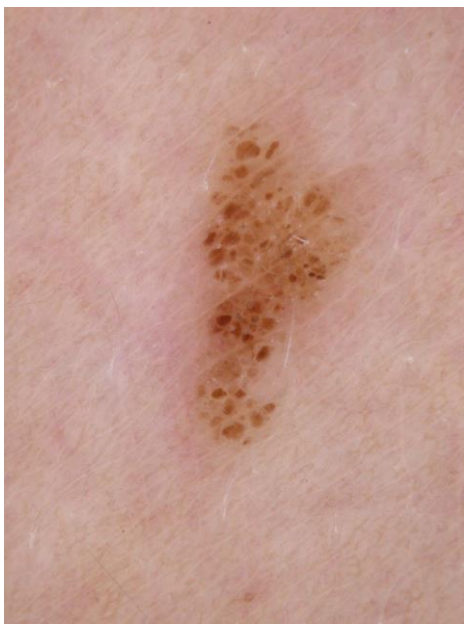
Argentina (from Horacio Cabo)

Therefore we ask you for country images on dermoscopy on which you see any country, continent, city, map, banner etc. of our world - here two examples: